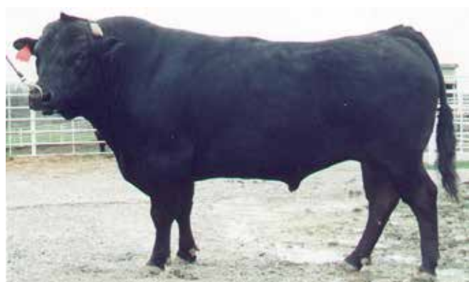
TF Mitsuhiokura - Okayama prefecture line