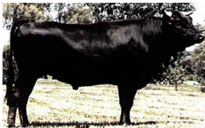
Michifuku - Tajima strain

Known as 'red' lines (Akaushi), Kochi and Kumamoto in Australia, have been strongly influenced by Korean and European breeds, particularly Simmental.