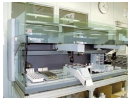
The Freedom EVO workstation at the Maebashi Institute of Animal Science, LIAJ.