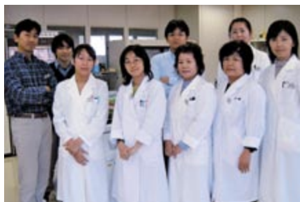
The Division of Animal Genetics at the Maebashi Institute of Animal Science, LIAJ.

"The Ministry of Agriculture, Forestry and Fisheries of Japan has entrusted LIAJ with the task of storing beef samples taken after slaughter, as well as individual identification testing of the stored samples and samples collected from retailers. By carrying out the DNA testing we verify that the traceability system is functioning precisely as specified. For this testing, the cattle DNA analysis technology is essential for individual identification."