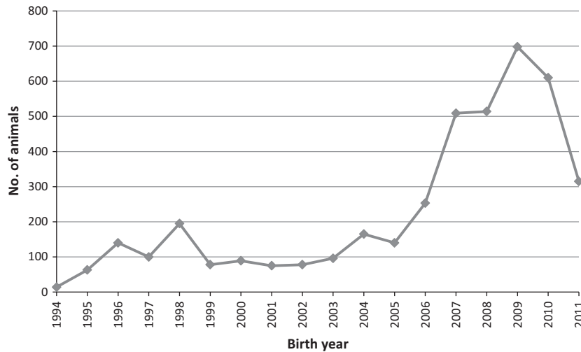
Figure 1 Number of full-blood Wagyu registered with the American Wagyu Association by year of birth between 1994 and 2011.