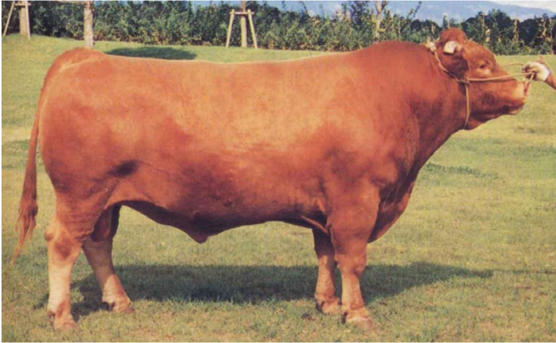
Fig. 6. Japanese Brown, Kumamoto strain (Bull)