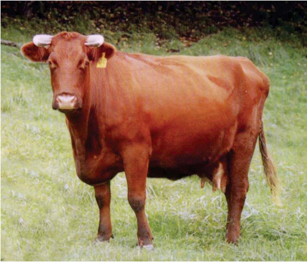
Fig. 8. Japanese Shorthorn (Cow)