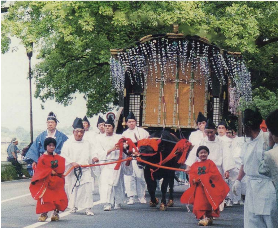
Fig. 2. Cattle in Japanese old fashion style festival