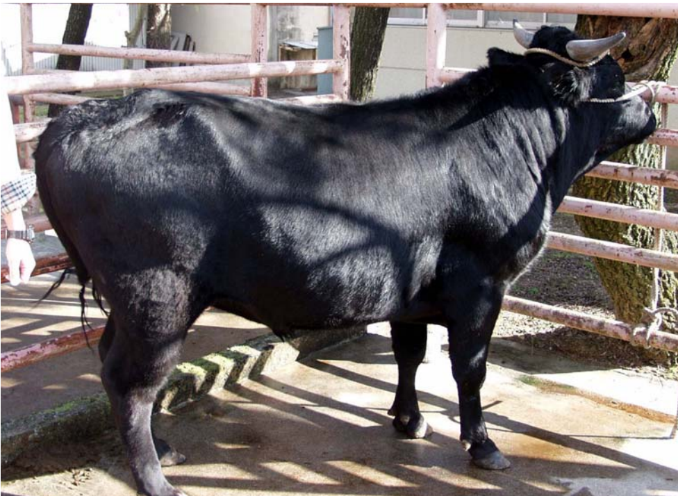
Fig. 3. Mishima Cattle (Bull)