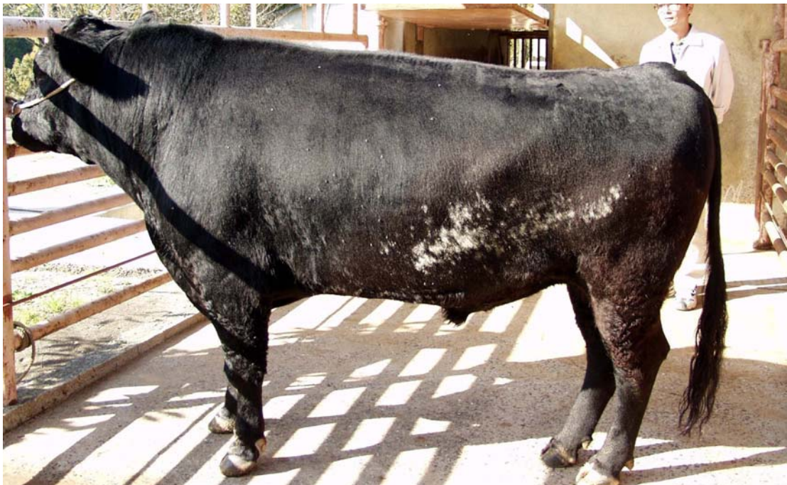
Fig. 7. Japanese Poll (Bull)