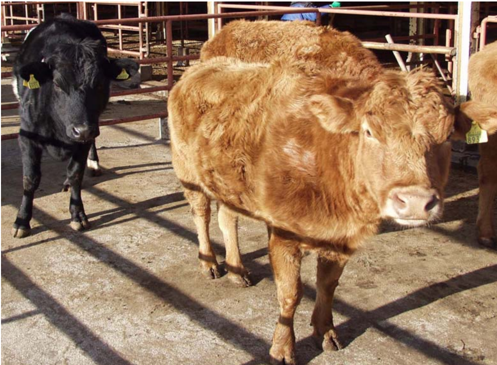
Fig. 4. Kuchinoshima Feral Cattle