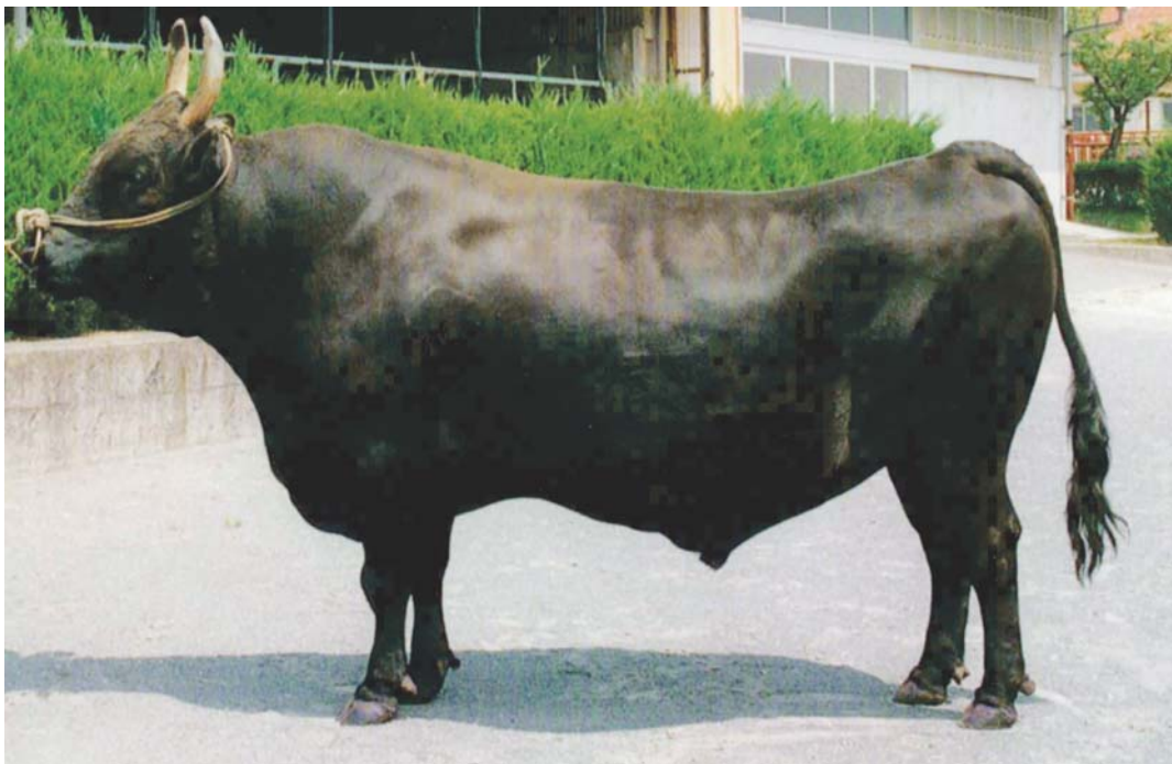
Fig. 5. Japanese Black (Bull)